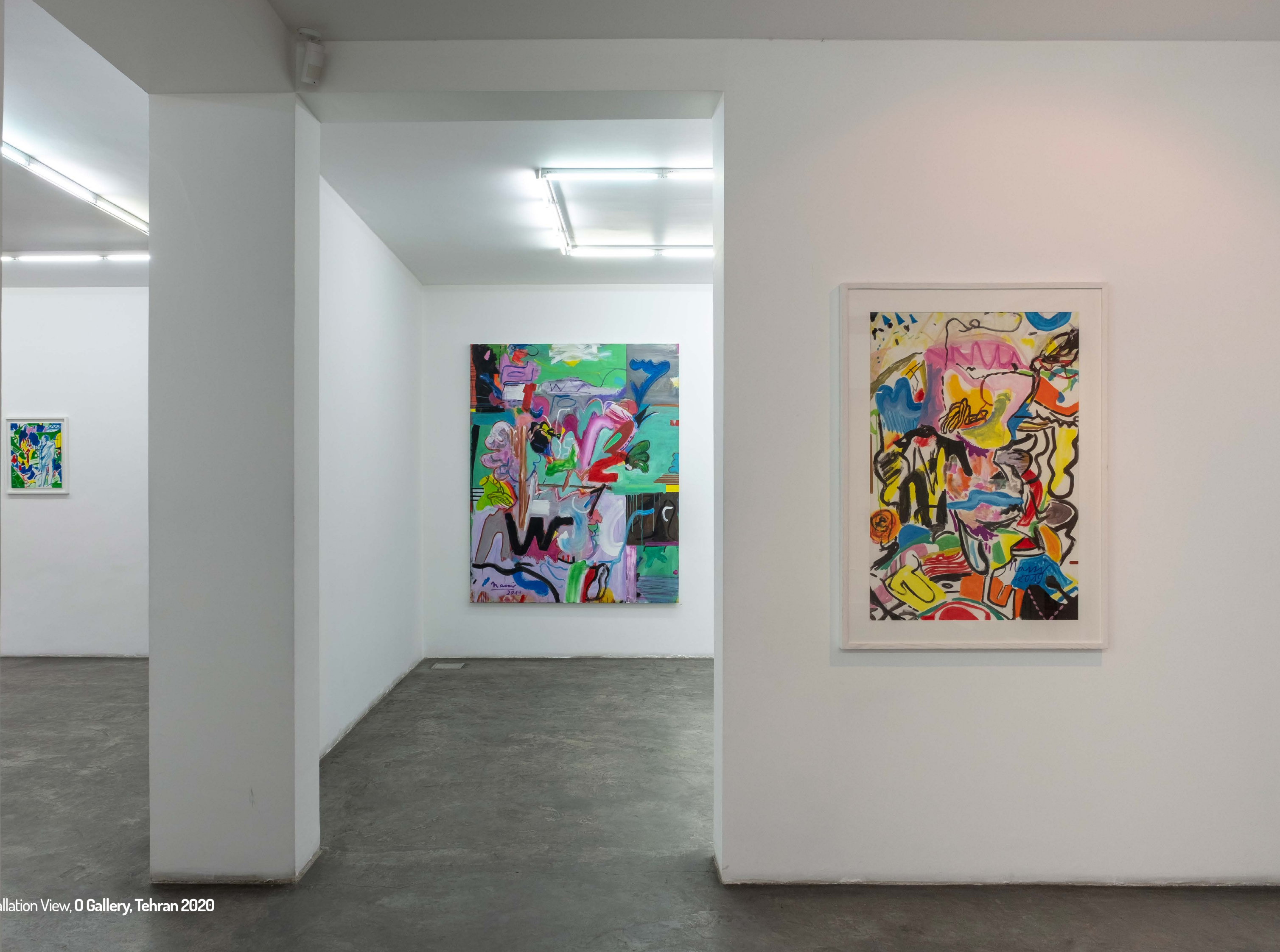
Installation View, O Gallery, Tehran 2020