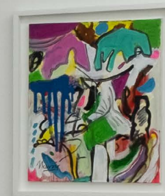
Installation View, O Gallery, Tehran 2020