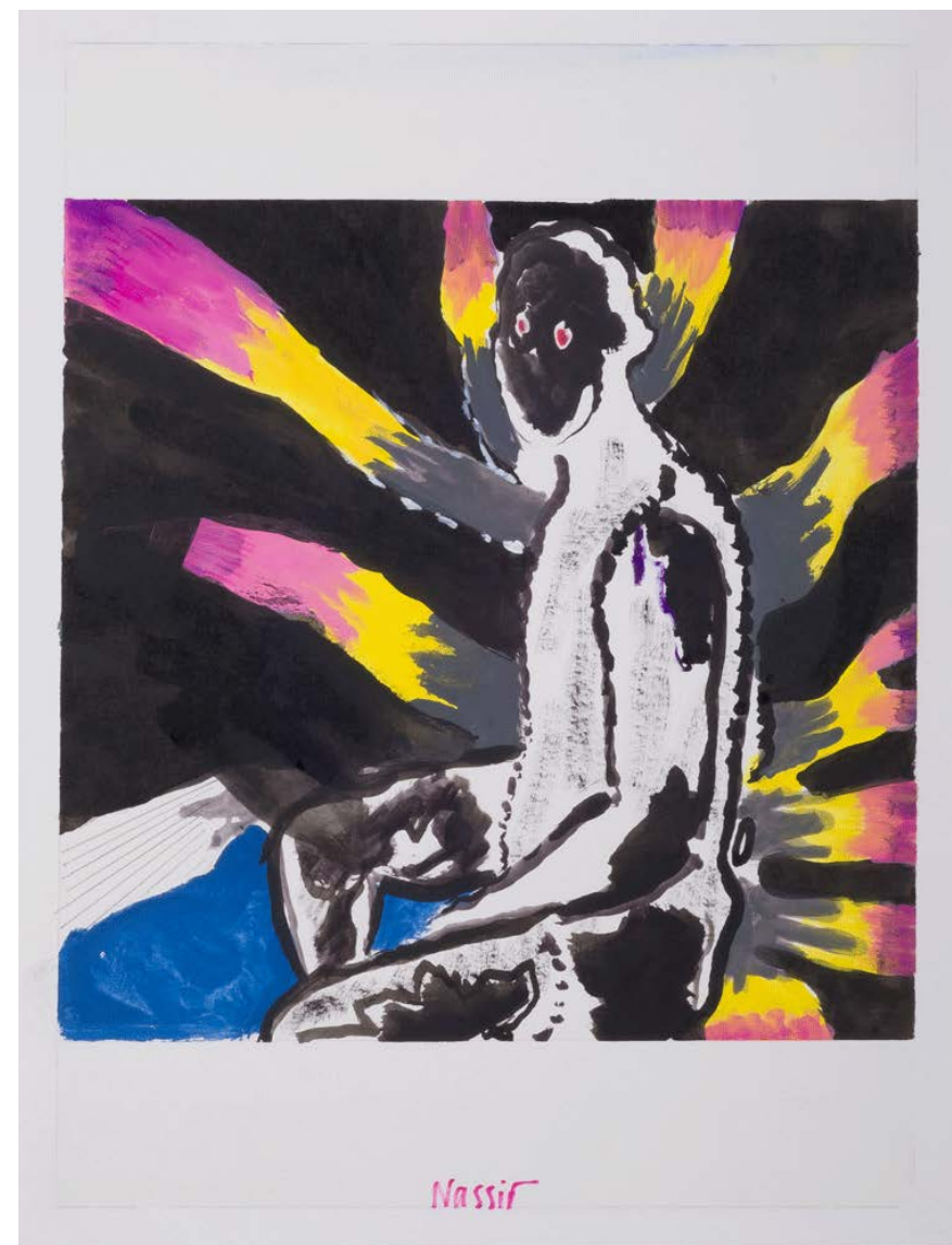
Untitled Mixed media on paper 40x30 cm Undated