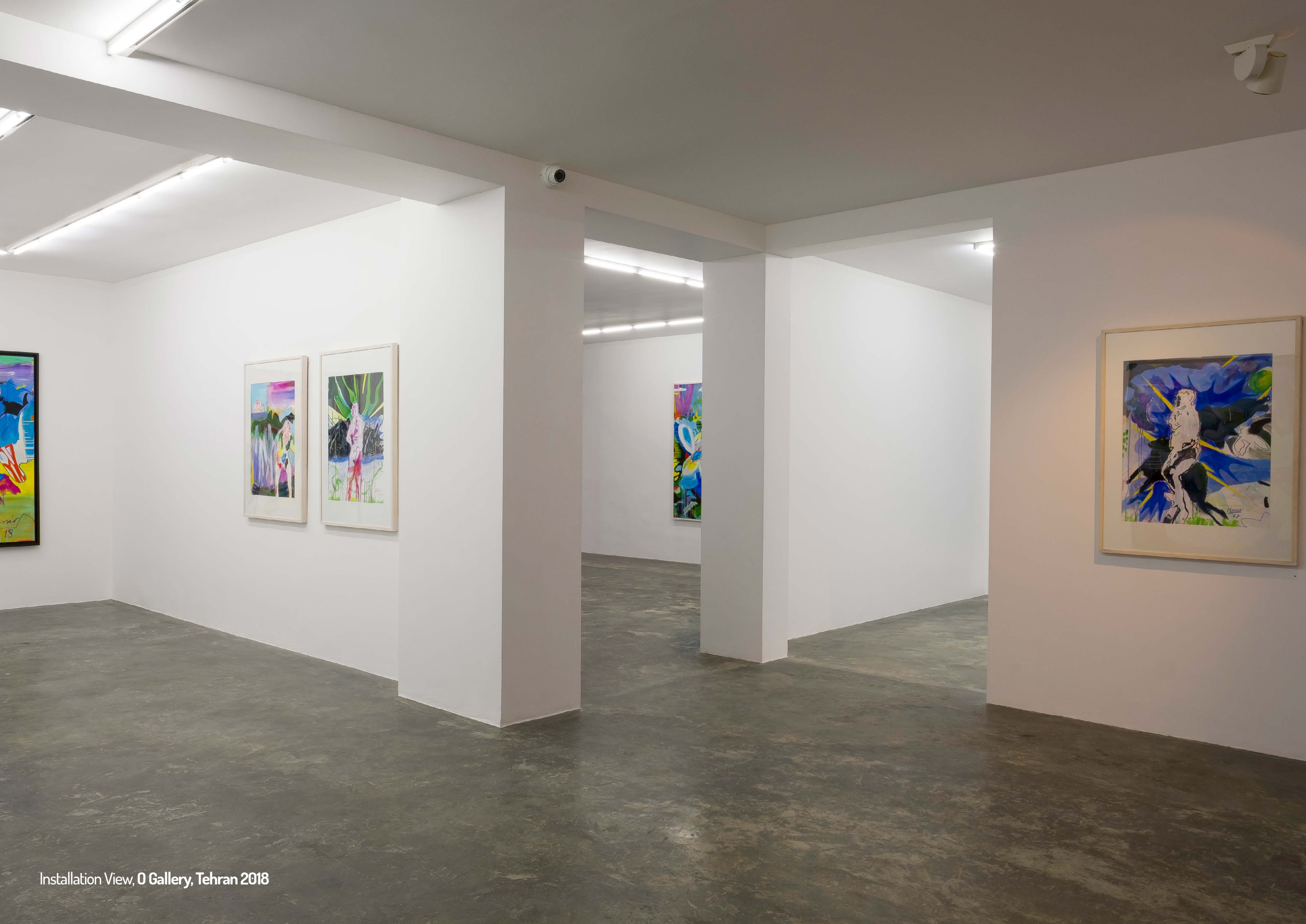
Installation View, O Gallery, Tehran 2018