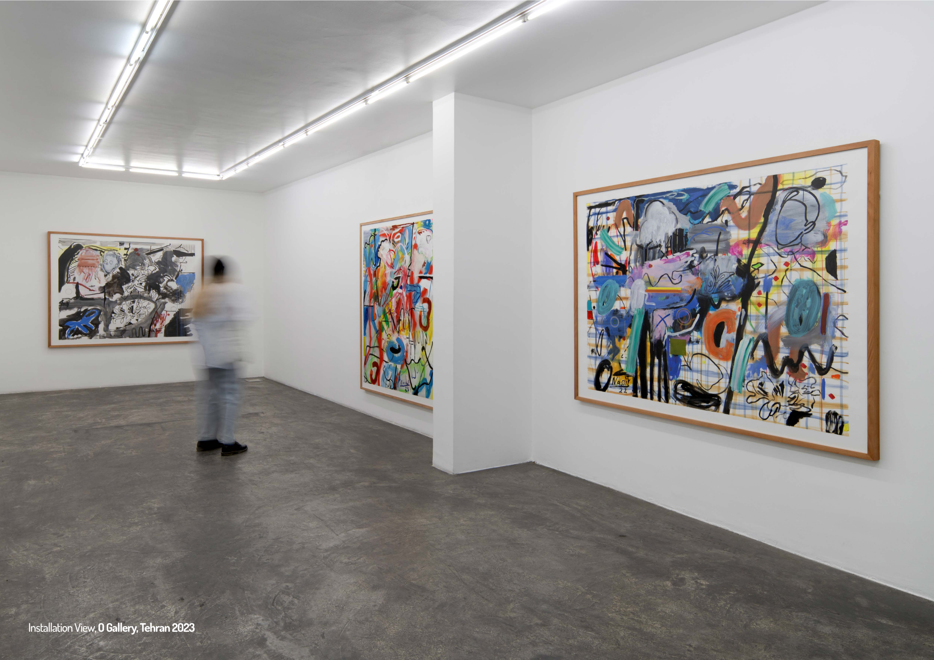
Installation View, O Gallery, Tehran 2023