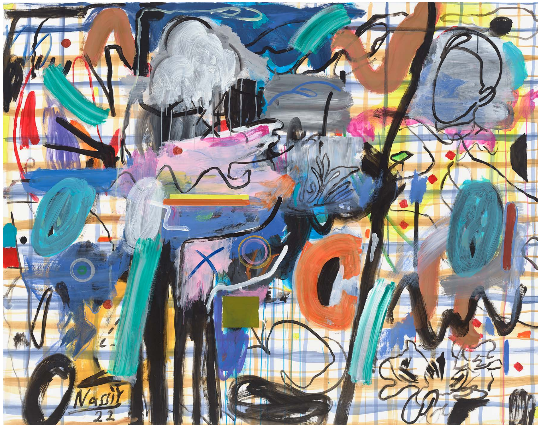
Untitled Pencil, ink and acrylic on paper 134x167 cm 2022