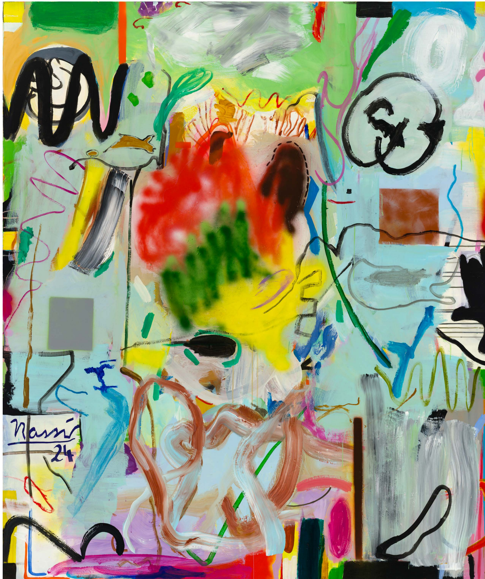
Untitled Acrylic on canvas 190x160 cm 2024