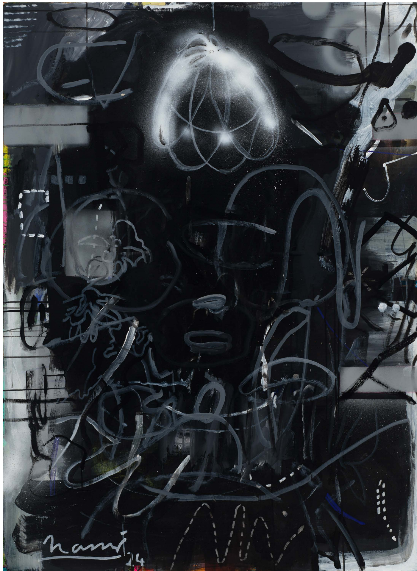
Untitled Acrylic on canvas 150x110 cm 2024