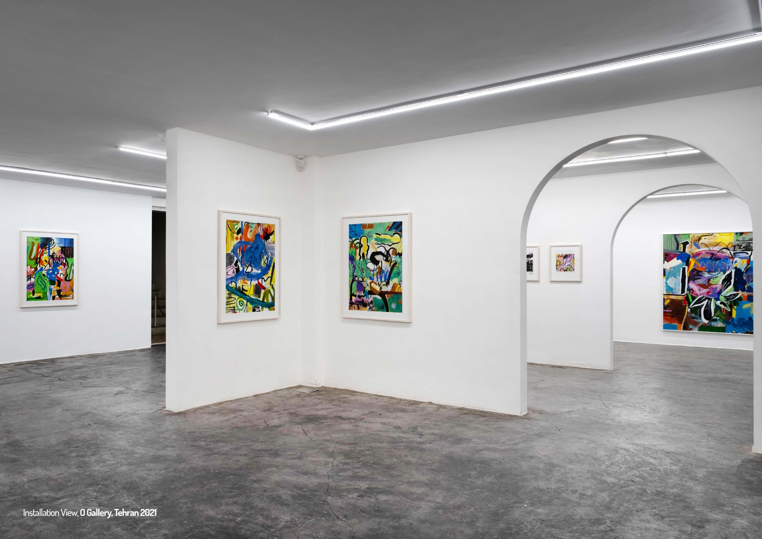
Installation View, O Gallery, Tehran 2021