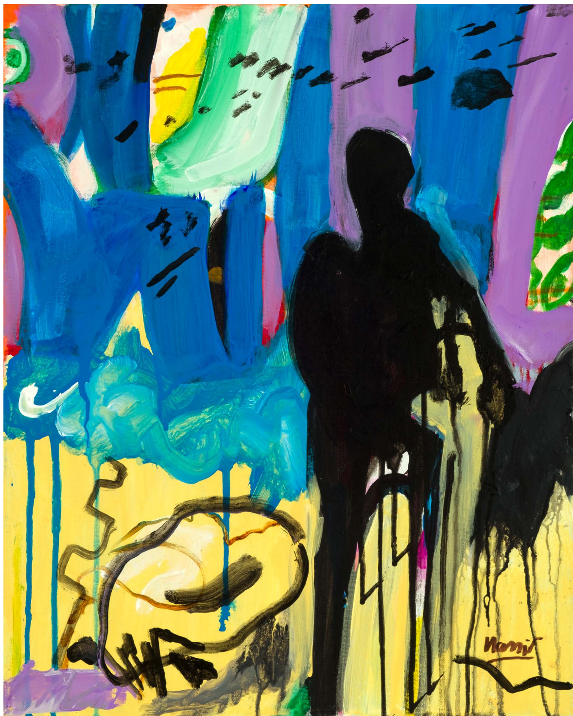
Untitled Acrylic on canvas 50x40 cm each Undated