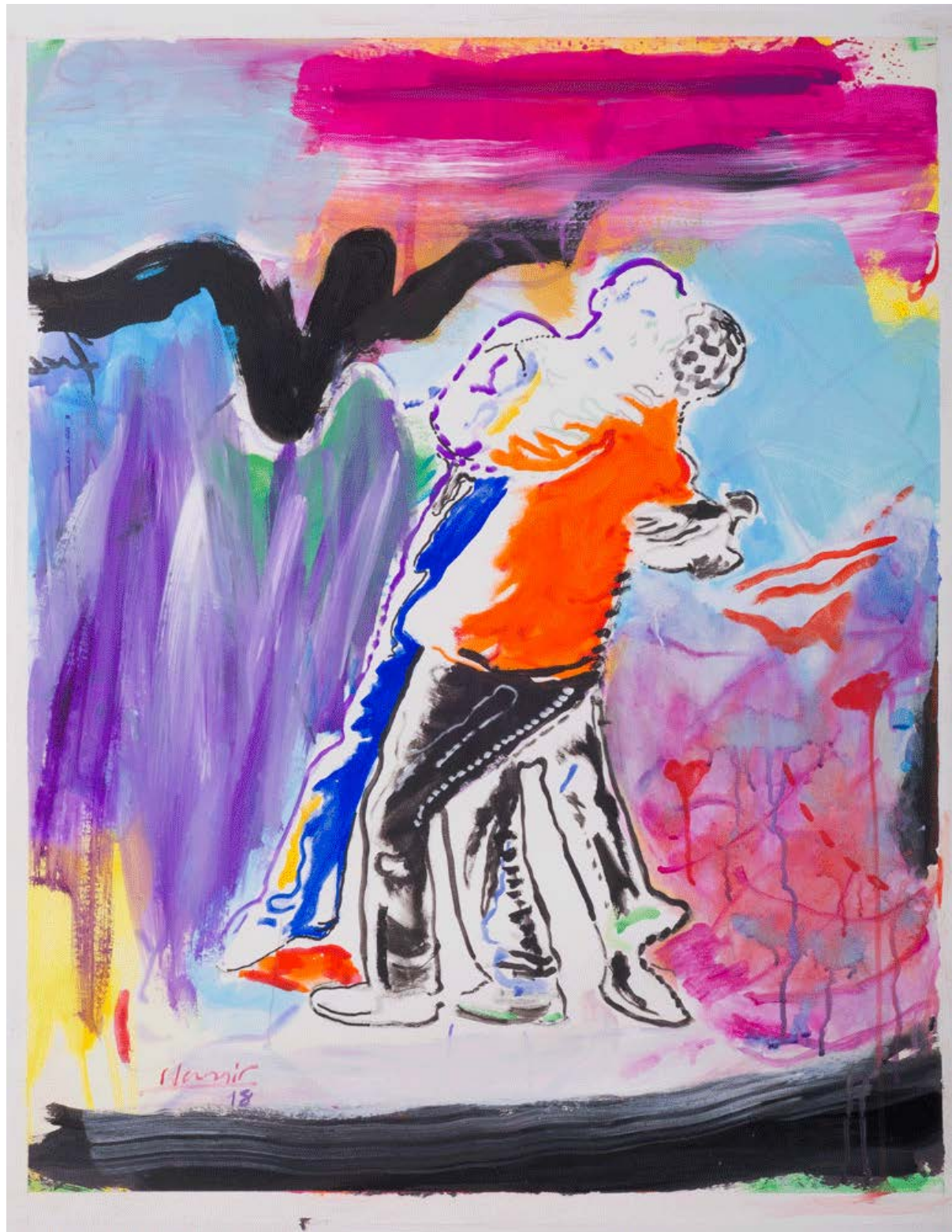
Untitled Mixed media on paper 86x66.5 cm 2018