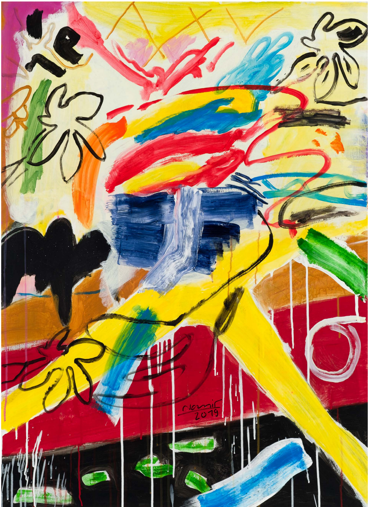
Untitled Mixed media on paper 105x75 cm 2019