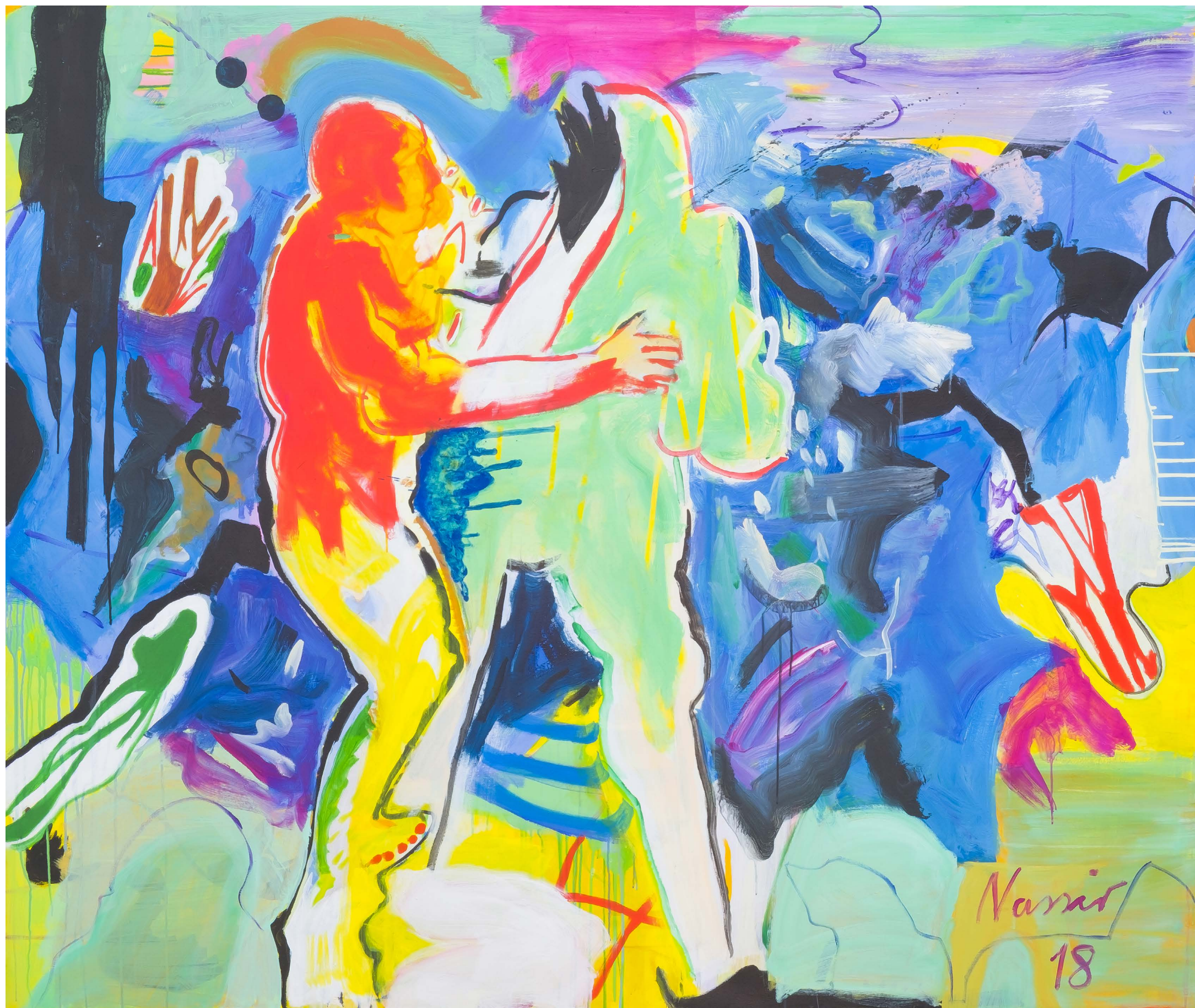
Untitled Arylic on canvas 160x190 cm 2018