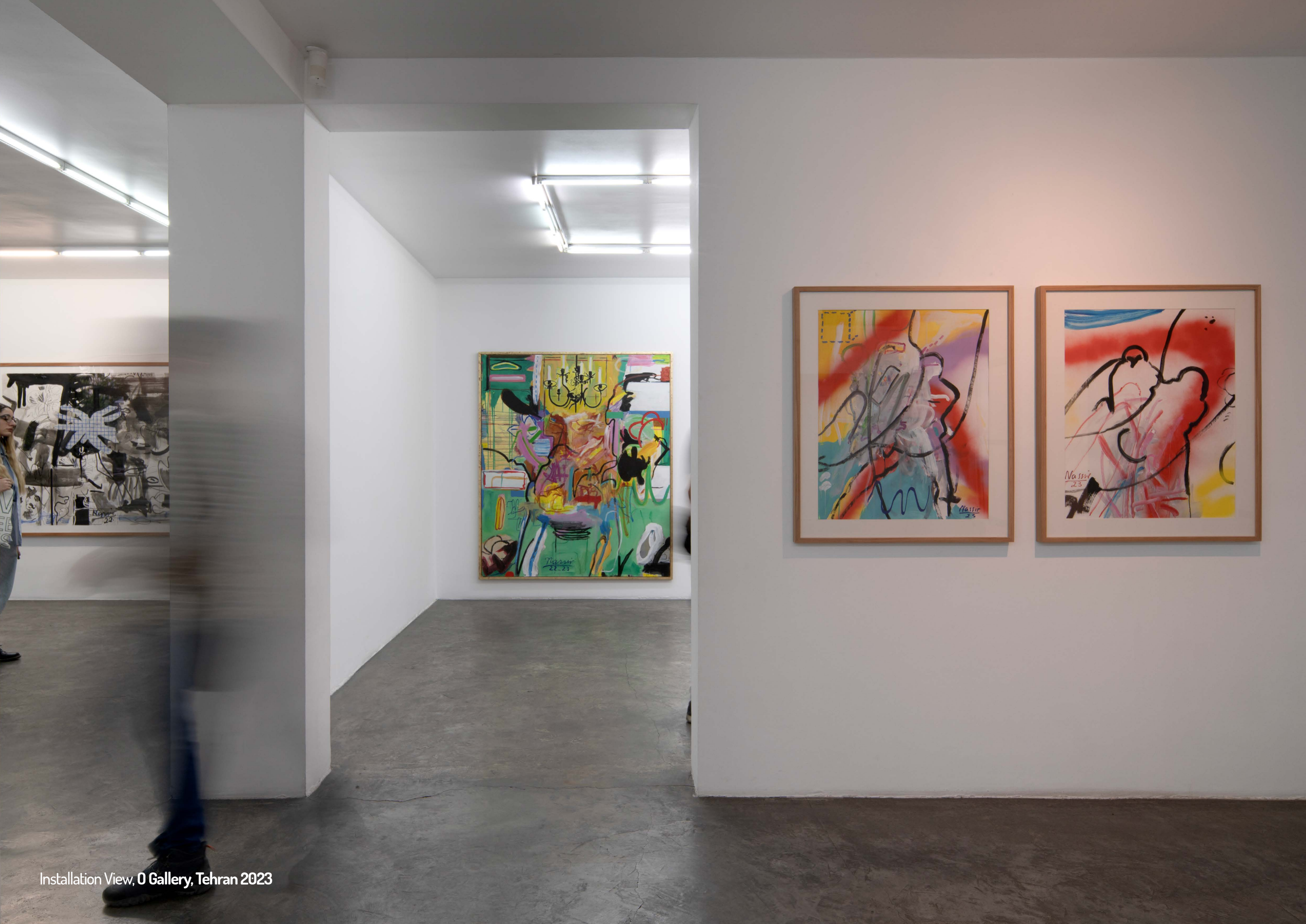
Installation View, O Gallery, Tehran 2023