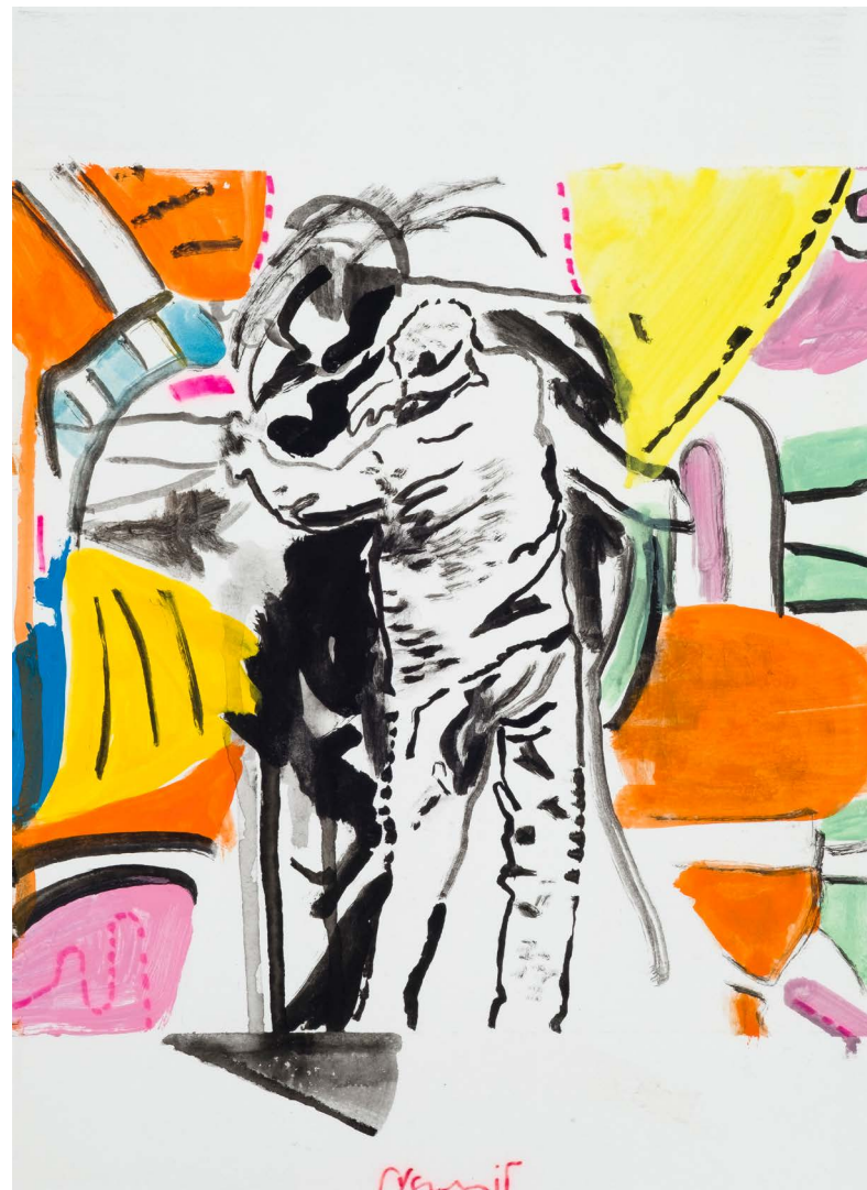
Untitled Mixed media on paper 40x30 cm each Undated