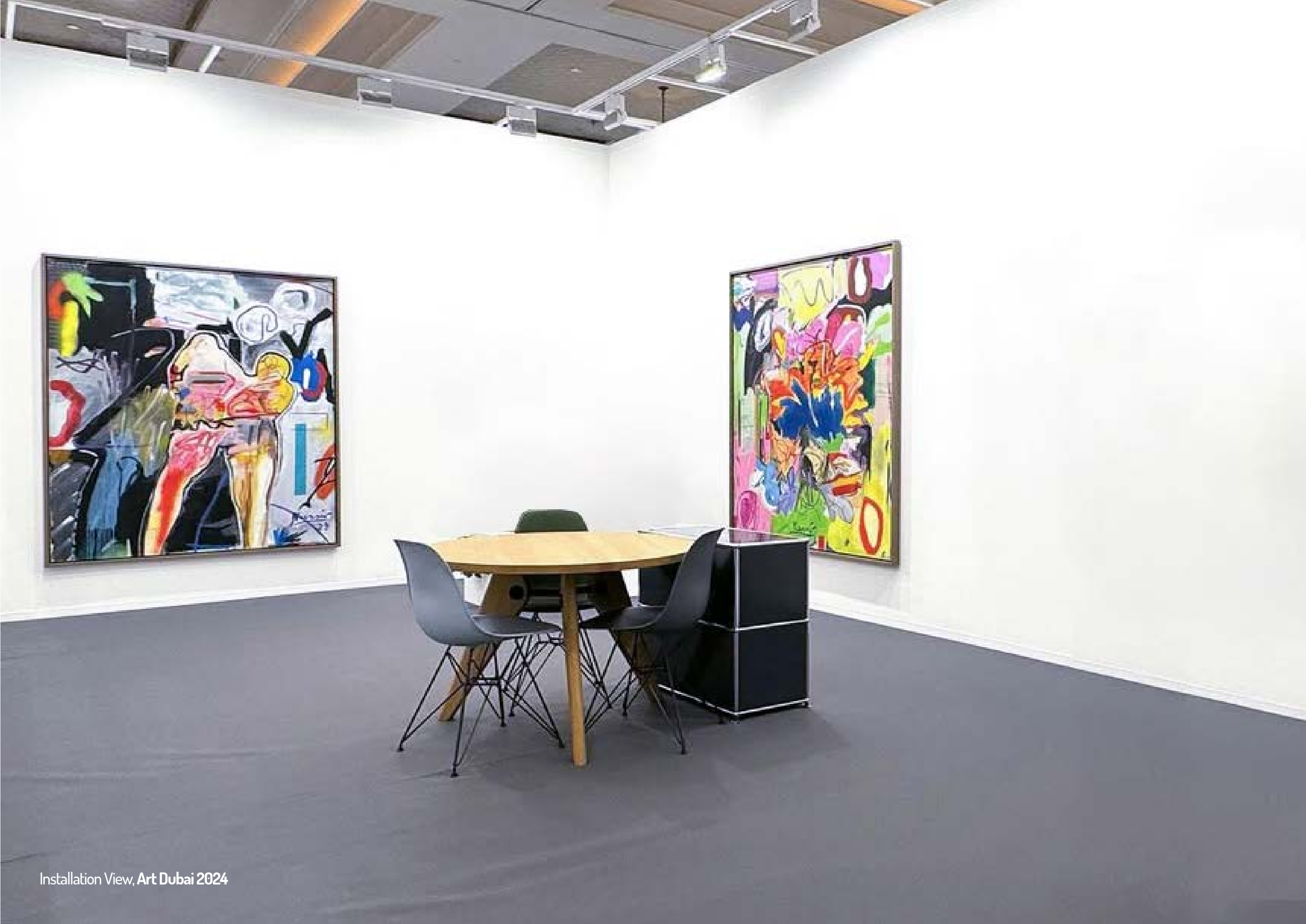
Installation View, Art Dubai 2024