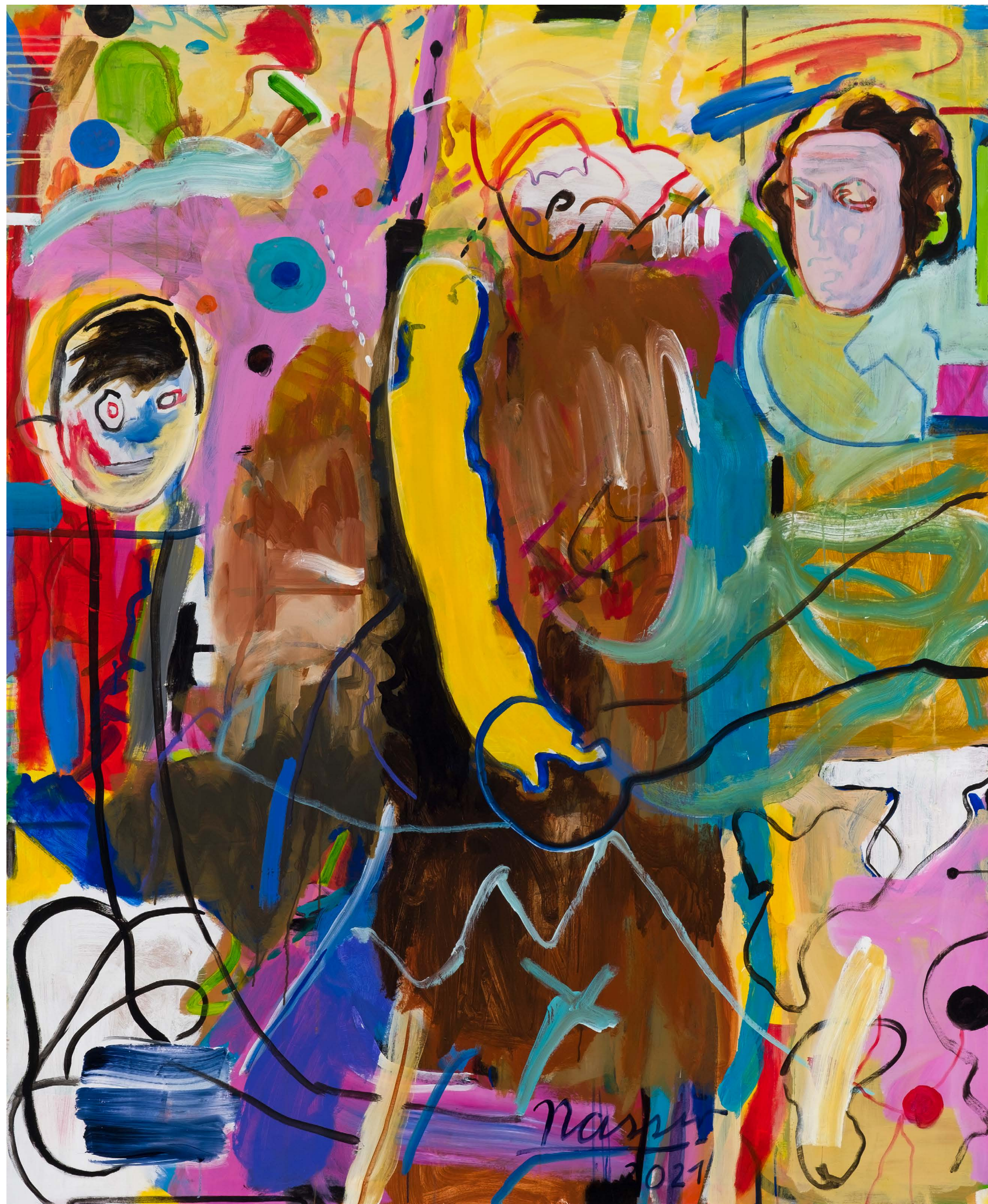
Untitled Acrylic on canvas 195x160 cm 2021